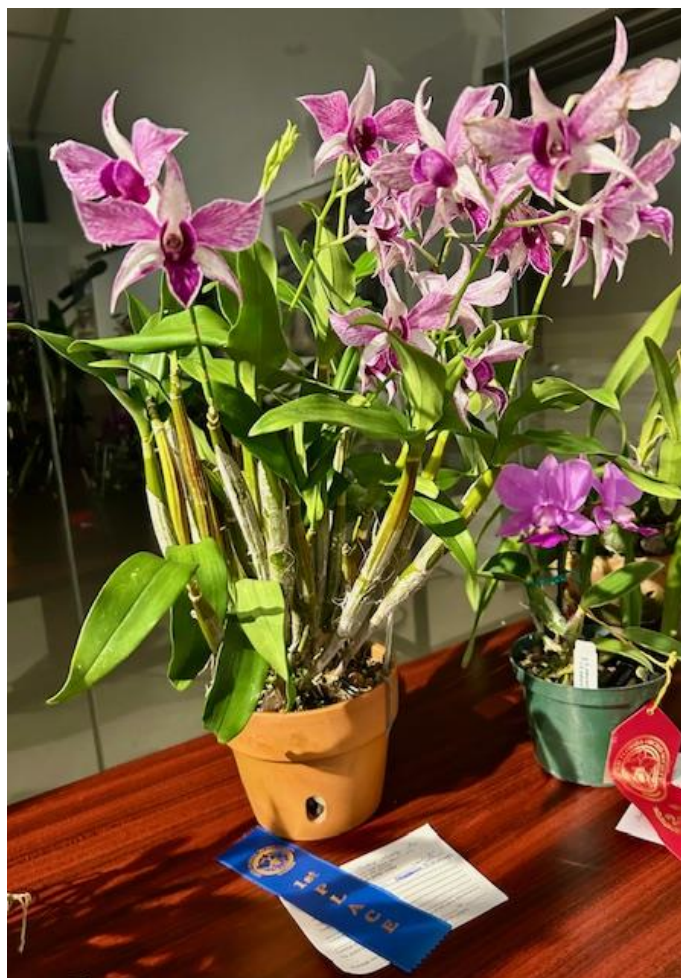
Den. Fire Wings - Virginia Benitez