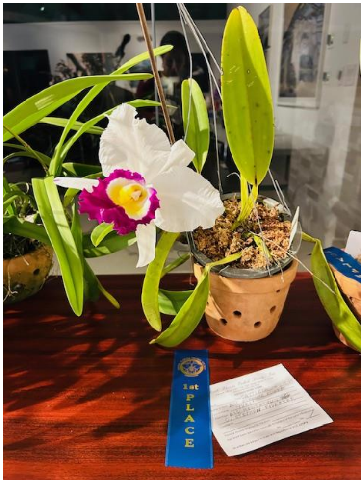
Rlc. Blanche Asiaka "Yuki" FCC/AOS - Charles Asche